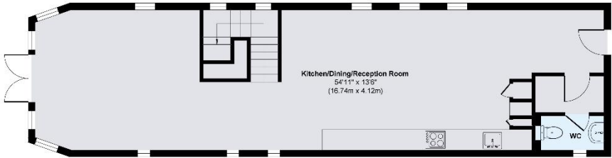
Upper Deck Approximate Floor Area 727 sq. ft (67.59 sq. m)